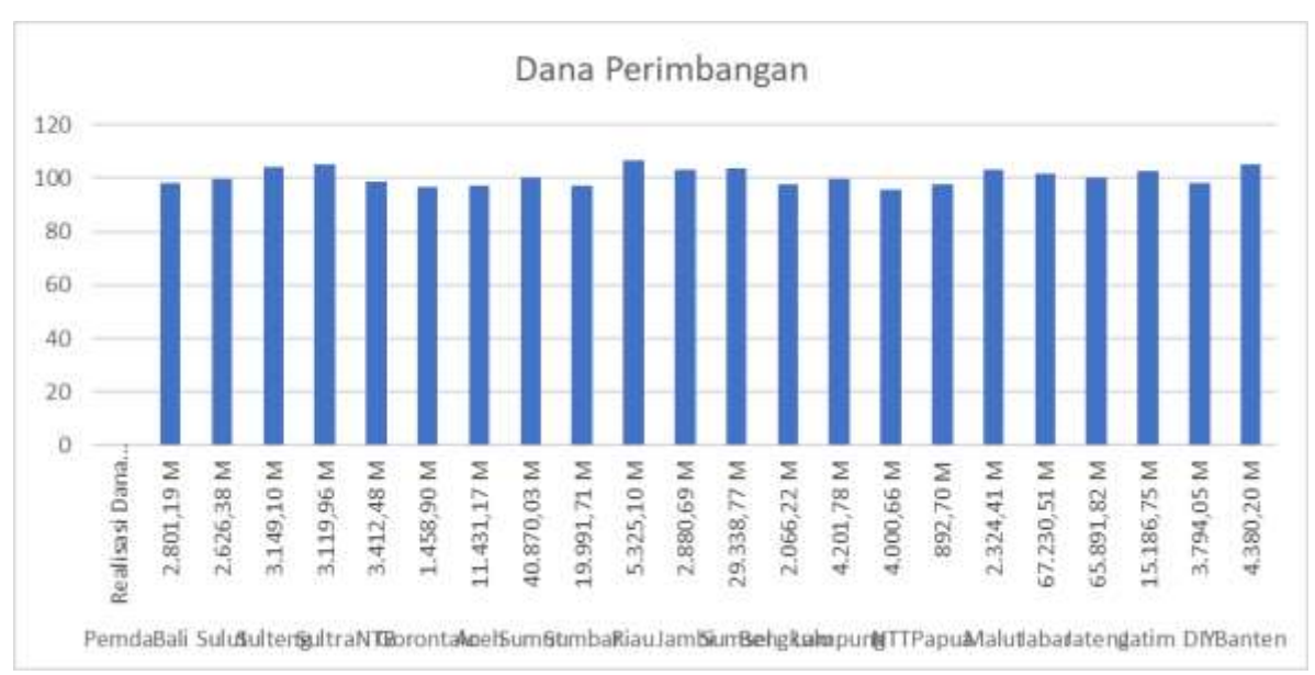
Figure 3 Realization of Provincial Government Balancing Funds in Indonesia in 2021